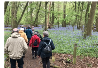
Gobions Woods—bluebell walk

Wear appropriate footwear and clothing and bring a bottle of water.